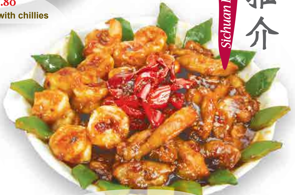
龍鳳相會 £19.80 Stir fried spiced king prawns and sliced chicken