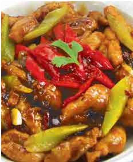
貴州香辣雞 £18.80 Guizhou style fried sliced chicken with chillies