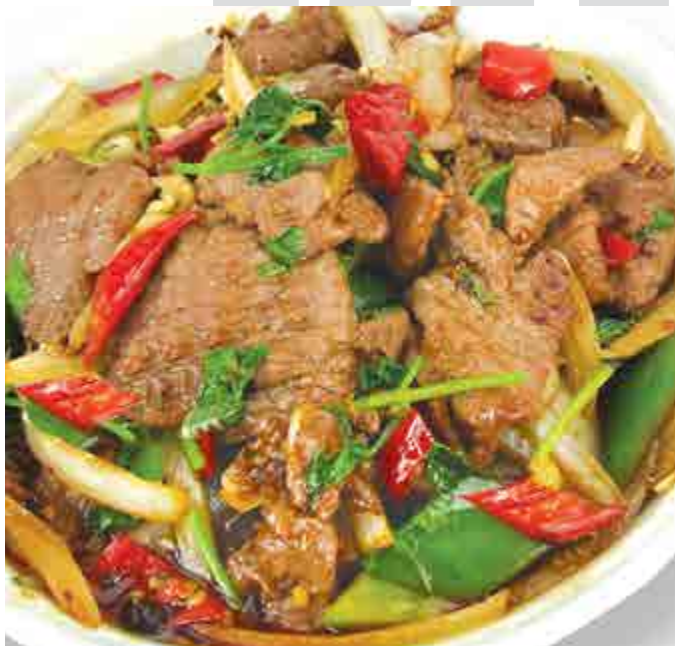
老乾媽炒羊肉 £19.80 Stir fried sliced mutton in Laoganma chilli sauce