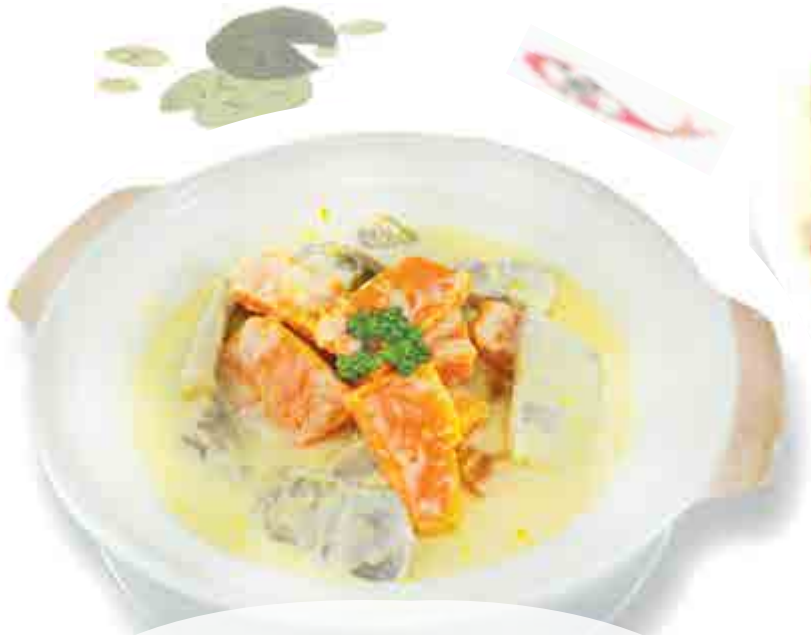
奶香南瓜香芋煲 £17.80 Braised sliced pumpkin, taro cook with milk and butter served in a clay pot