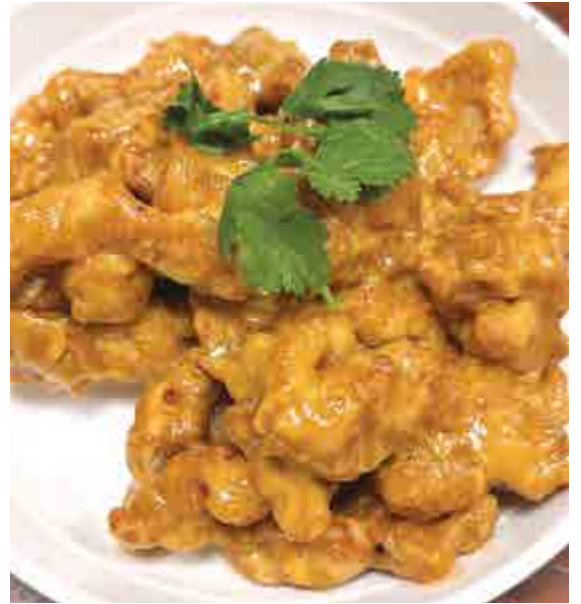
沙拉豬扒 £16.80 Pork chops cooked with salad cream