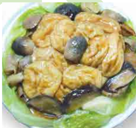
三菇扒豆腐 (素) £17.50 Braised beancurd puff with trio mushrooms (V)