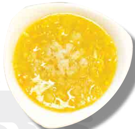
粟米魚肚羹 (每位) £7.50 (per head) Fish maw and sweet corn soup