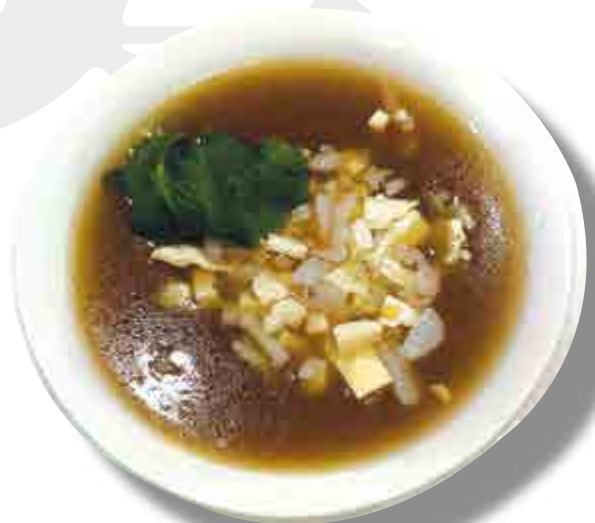
正宗海鮮酸辣湯 (每位) £7.00 (per head) Hot & sour diced seafood soup