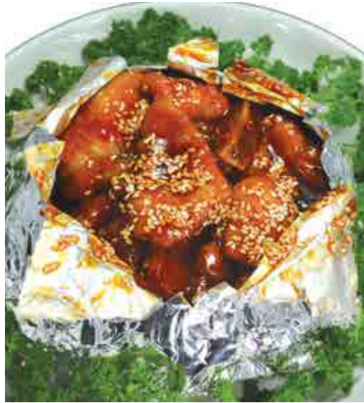
錫燒豬扒 £16.80 Foil grilled pork chops with sesame seeds