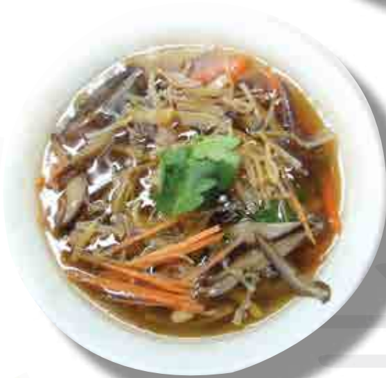
瑤柱鴨絲羹 (每位) £6.80 (per head) Sundried scallops and shredded duck soup