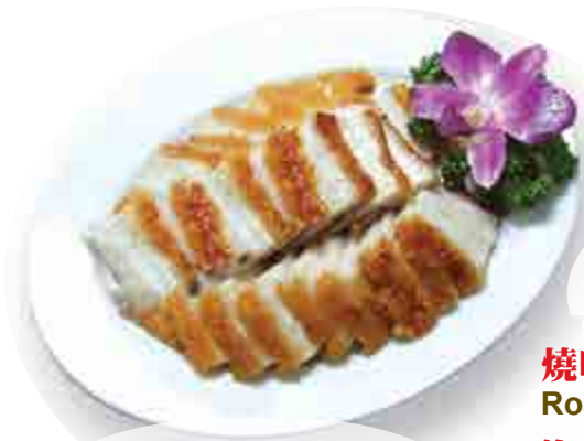
脆皮燒肉 £16.50 Roasted belly pork