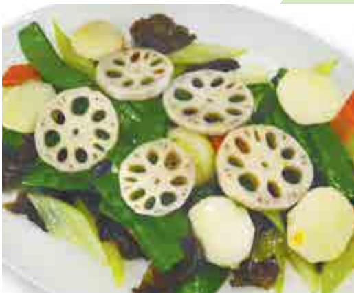
洋水芹香 (素) £15.80 Stir fried sliced lotus root with water chestnuts, mangetout, celery, carrot and black fungus (V)