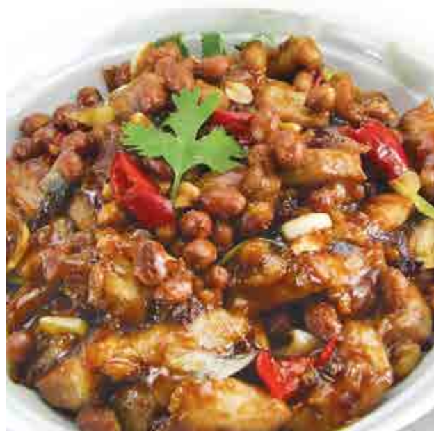
宮保雞丁 £18.80 Gongbao diced chicken with peanuts and dried chillies