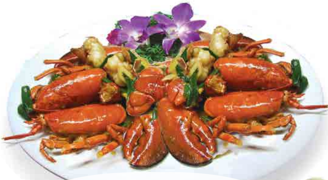
薑蔥焗龍蝦 Seasonal price 時價 Baked lobster with spring onions and ginger