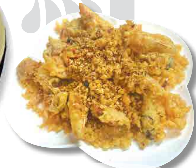
避風塘三寶 (軟殼蟹、大蝦及生蠔) £26.80 Harbour shelter style deep fried three treasures (Soft shell crab, king prawns and oysters)