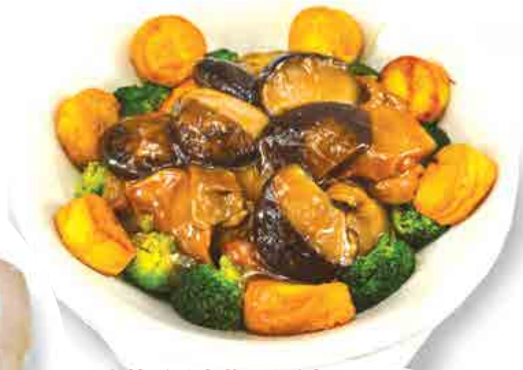
少林玉子素菜 (蛋豆腐) £19.80 Pan fried sliced egg beancurd and Chinese mushroom with vegetables