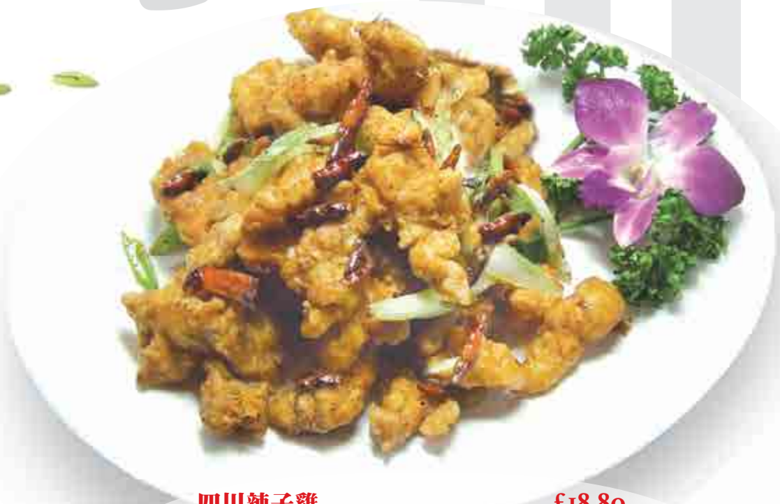
四川辣子雞 £18.80 Sichuan style spicy hot diced spring chicken