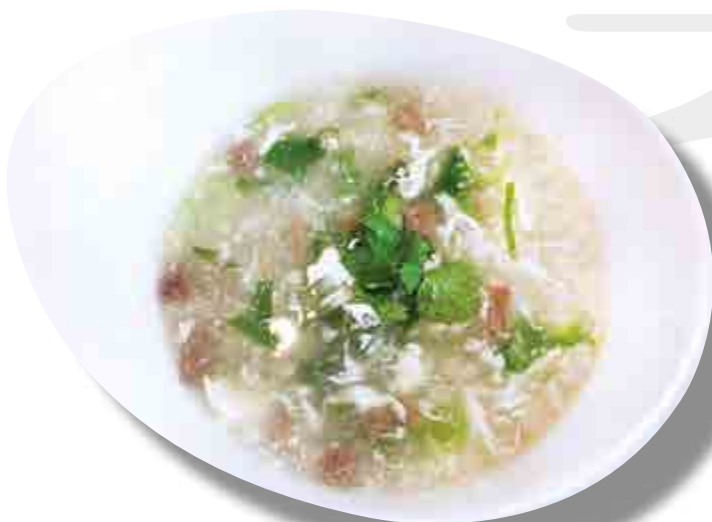
西湖牛肉羹 (每位) £6.50 (per head) West Lake beef thick soup