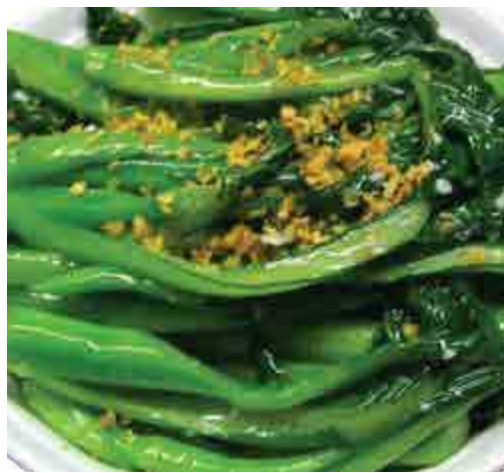
蒜蓉炒中國菜心 £19.80 Stir fried choy sum with crushed garlic