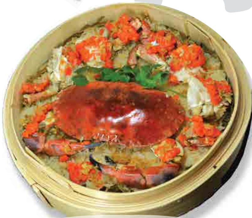
原籠糯米蒸蟹 £23.80 Steamed crab with garlic and glutinous rice in bamboo steamer

Ocean Treasure seafood special served in a clay pot.....£32.80