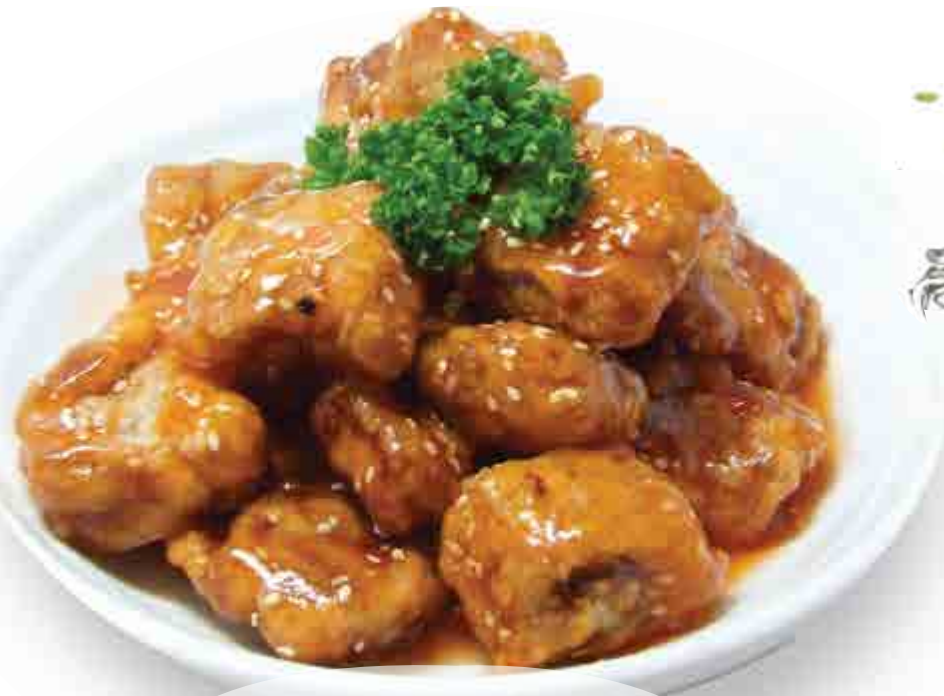
糖醋麻仁排骨 £17.80 Sweet vinegar spare ribs with sesame seeds