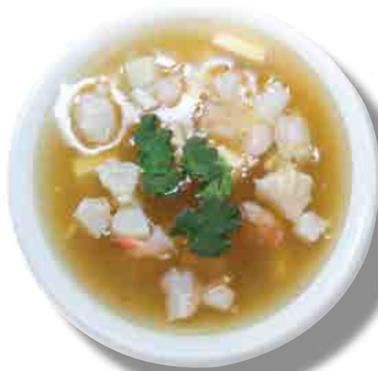
瑤柱海皇羹 (每位) £7.80 (per head) Sundried scallops and diced seafood soup