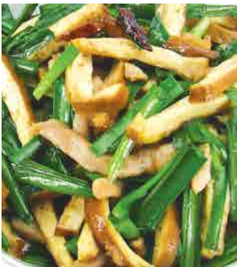
青韭肉絲豆乾 £17.80 Stir fried shredded pork with sliced dried tofu and chives