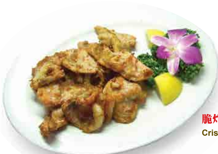
脆炸香茅豬扒 £16.80 Crispy fried pork chops marinated with lemon grass