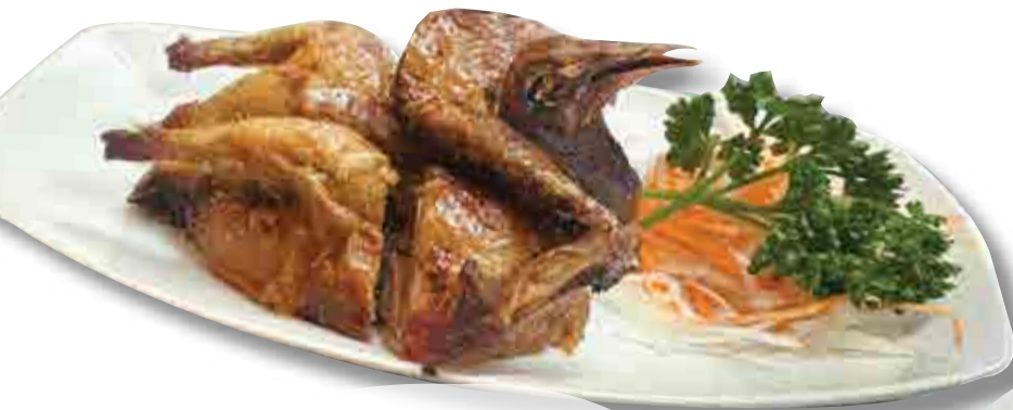
美味乳鴿 £14.80 每只 each Young pigeon braised in Chinese spices herbs, served deep fried