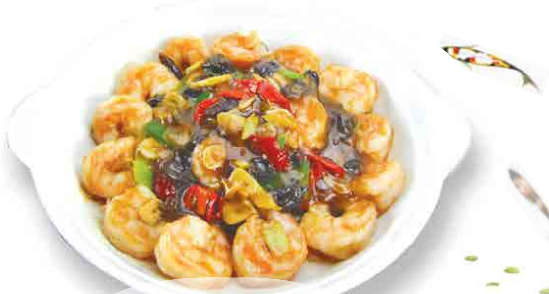
香辣蝦球 £20.80 Stir fried king prawns with chillies