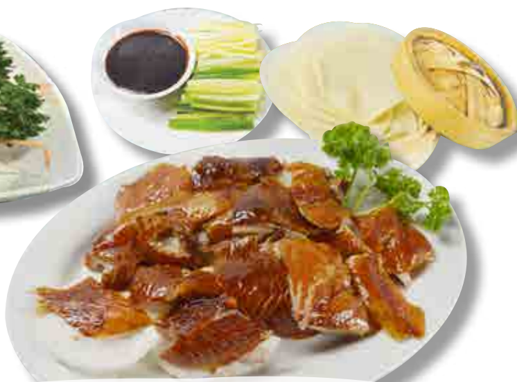
片皮鴨 每只 Whole £42.00 半只 Half £26.00 Sliced glazed roast duck served with spring onions, hoi-sin sauce & pancakes (另外椒鹽鴨架 每只 Whole £12.00 半只 Half £8.00)