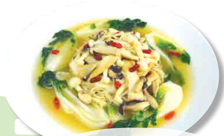
什菌上湯時蔬 (素) £18.80 Soaked assorted mushrooms with seasonal vegetables in high stock (V)