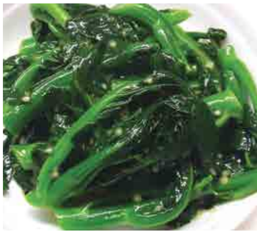
蒜蓉炒中國芥蘭 £19.80 Stir fried kai-lan with crushed garlic