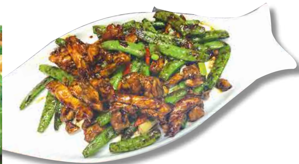
大千子雞 £18.80 Painter Daqian favourite dish stir fried sliced chicken with chillies