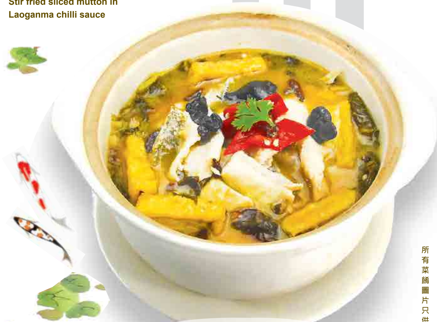
沙煲酸菜鱸魚 £36.80 Sea bass with preserved pickled vegetables casserole