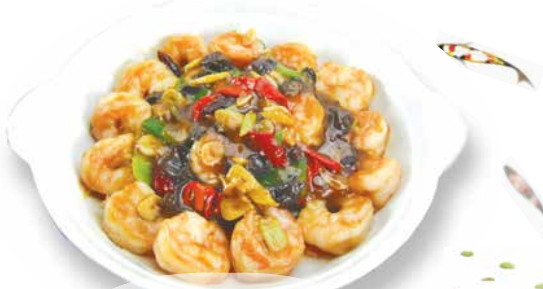
香辣蝦球 £20.80 Stir fried king prawns with chillies