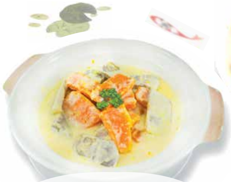
奶香南瓜香芋煲 £17.80 Braised sliced pumpkin, taro cook with milk and butter served in a clay pot