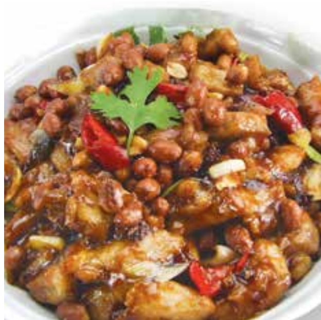
宮保雞丁 £18.80 Gongbao diced chicken with peanuts and dried chillies