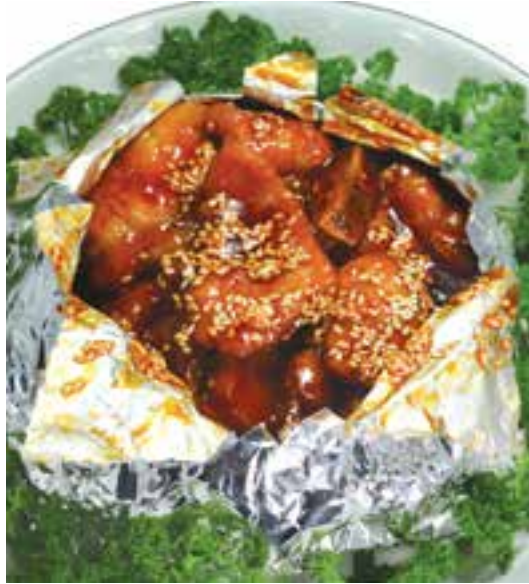
錫燒豬扒 £16.80 Foil grilled pork chops with sesame seeds