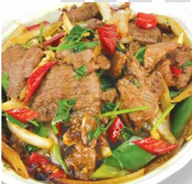
老乾媽炒羊肉 £19.80 Stir fried sliced mutton in Laoganma chilli sauce