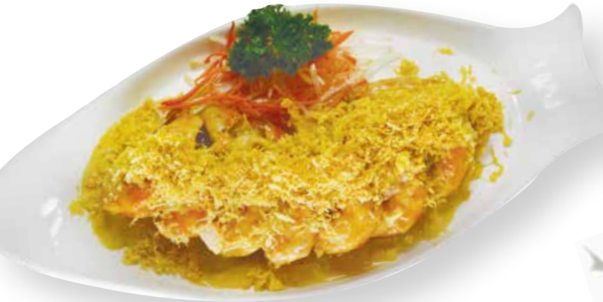
金絲奶油大蝦 (十只) £26.80 Deep fried shell-on king prawns coated in fried egg batter