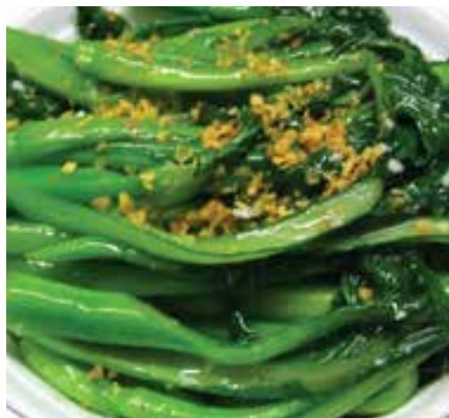
蒜蓉炒中國菜心 £19.80 Stir fried choy sum with crushed garlic