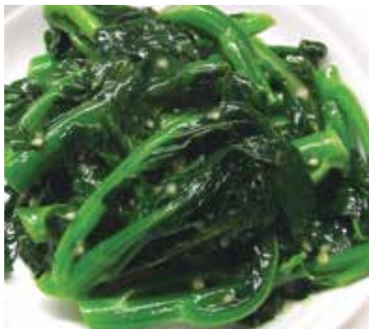
蒜蓉炒中國芥蘭 £19.80 Stir fried kai-lan with crushed garlic