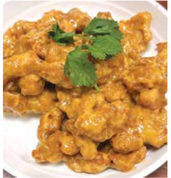
沙拉豬扒 £16.80 Pork chops cooked with salad cream

Salt & pepper pig's intestines stuffed with minced prawn ..... £24.80