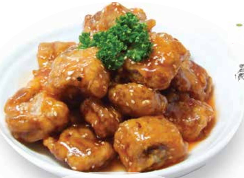
糖醋麻仁排骨 £17.80 Sweet vinegar spare ribs with sesame seeds