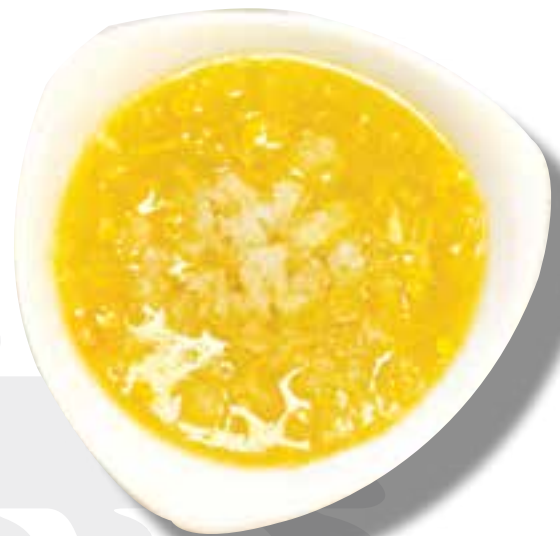
粟米魚肚羹 (每位) £7.50 (per head) Fish maw and sweet corn soup