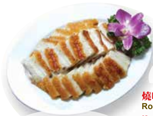
脆皮燒肉 £16.50 Roasted belly pork