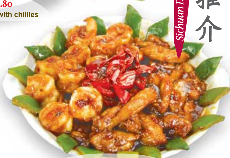
龍鳳相會 £19.80 Stir fried spiced king prawns and sliced chicken