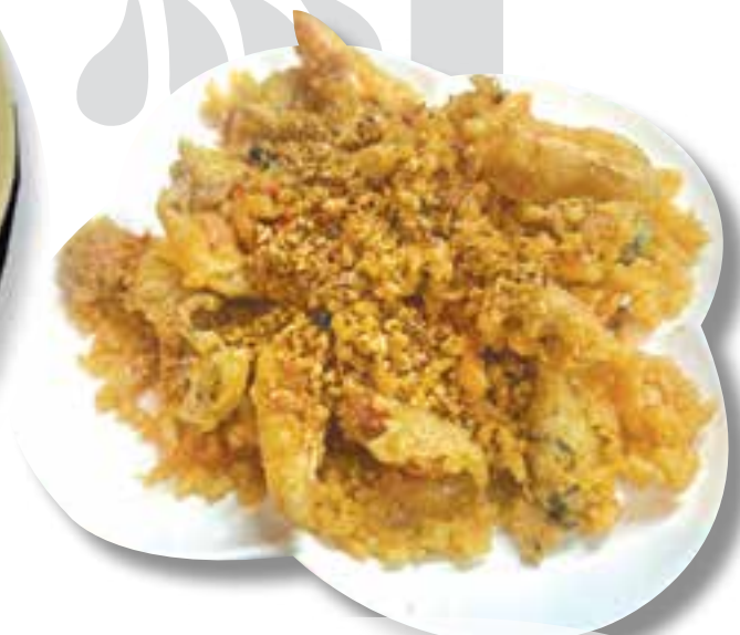
避風塘三寶 (軟殼蟹、大蝦及生蠔) £26.80 Harbour shelter style deep fried three treasures (Soft shell crab, king prawns and oysters)