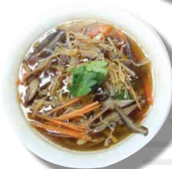
瑤柱鴨絲羹 (每位) £6.80 (per head) Sundried scallops and shredded duck soup