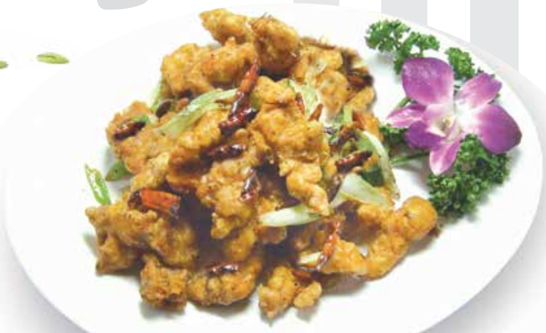
四川辣子雞 £18.80 Sichuan style spicy hot diced spring chicken