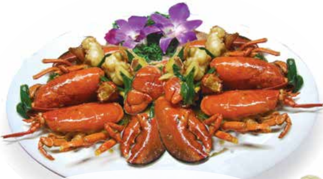
薑蔥焗龍蝦 Seasonal price 時價 Baked lobster with spring onions and ginger