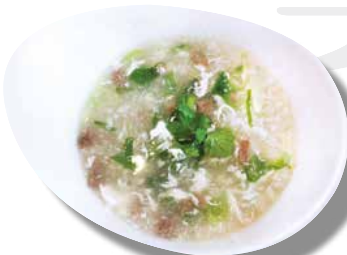
西湖牛肉羹 (每位) £6.50 (per head) West Lake beef thick soup