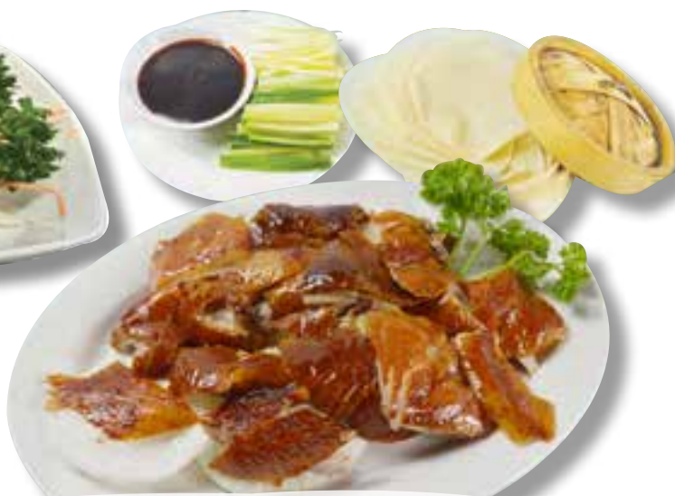
片皮鴨 每只 Whole £42.00 半只 Half £26.00 Sliced glazed roast duck served with spring onions, hoi-sin sauce & pancakes (另外椒鹽鴨架 每只 Whole £12.00 半只 Half £8.00 )