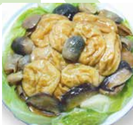
三菇扒豆腐 (素) £17.50 Braised beancurd puff with trio mushrooms (V)