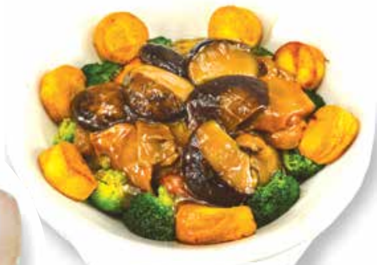
少林玉子素菜 (蛋豆腐) £19.80 Pan fried sliced egg beancurd and Chinese mushroom with vegetables