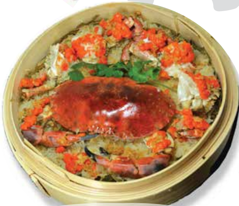
原籠糯米蒸蟹 £23.80 Steamed crab with garlic and glutinous rice in bamboo steamer

Ocean Treasure seafood special served in a clay pot.....£32.80