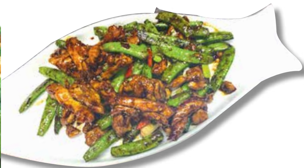
大千子雞 £18.80 Painter Daqian favourite dish stir fried sliced chicken with chillies