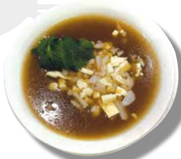
正宗海鮮酸辣湯 (每位) £7.00 (per head) Hot & sour diced seafood soup