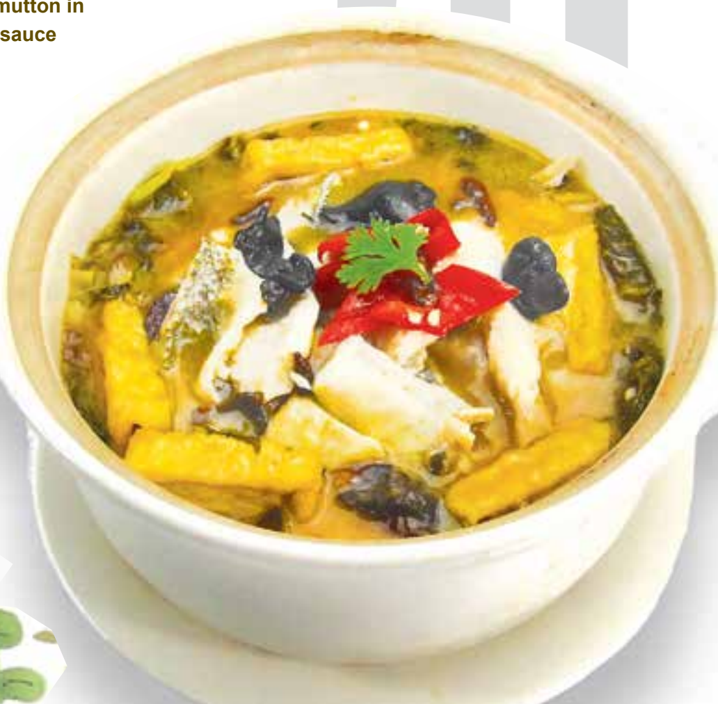
沙煲酸菜鱸魚 £36.80 Sea bass with preserved pickled vegetables casserole