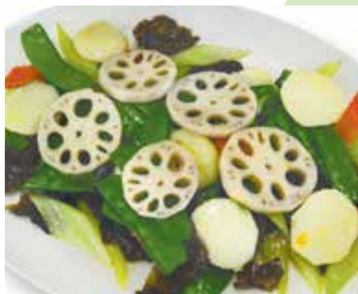
泮水芹香 (素) £15.80 Stir fried sliced lotus root with water chestnuts, mangetout, celery, carrot and black fungus (V)