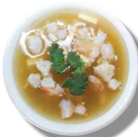
瑤柱海皇羹 (每位) £7.80 (per head) Sundried scallops and diced seafood soup