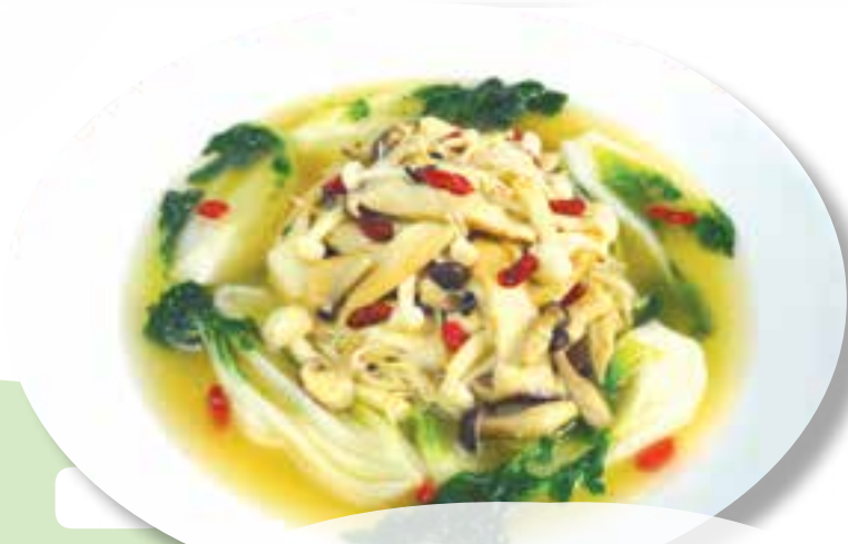
什菌上湯時蔬 (素) £18.80 Soaked assorted mushrooms with seasonal vegetables in high stock (V)