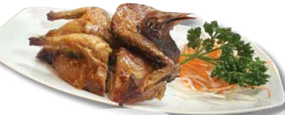
美味乳鴿 £14.80 每只 each Young pigeon braised in Chinese spices herbs, served deep fried