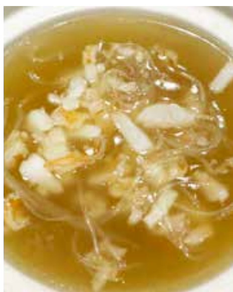
紅燒海鮮翅 (每位) £18.00 (per head) Diced seafood shark's fin soup