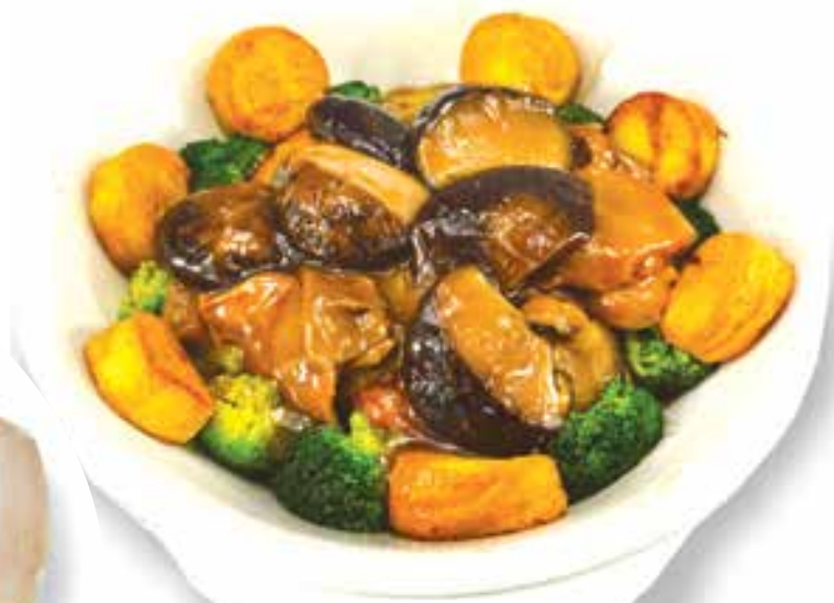
少林玉子素菜 (蛋豆腐) £18.00 Sliced egg beancurd and Chinese mushroom with vegetables