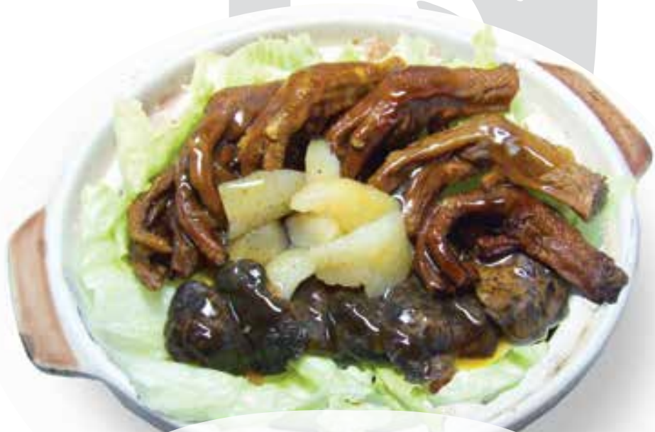
北菇海參扒鴨掌 £26.80 Braised sliced sea cucumber with duck feet and mushrooms 或 (鵝掌 另加 £3.00 Goose feet add extra £3.00)