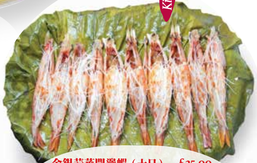
金銀蒜蒸開邊蝦 (十只) £25.00 Open sliced steamed king prawns with fresh crushed garlic

Deep fried shell-on king prawns coated with salted egg yolk ..... £26.00