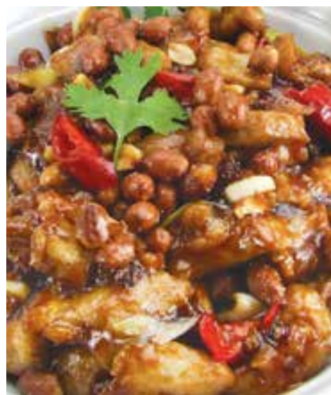
宮保雞丁 £16.50 Gongbao diced chicken with peanuts and dried chillies