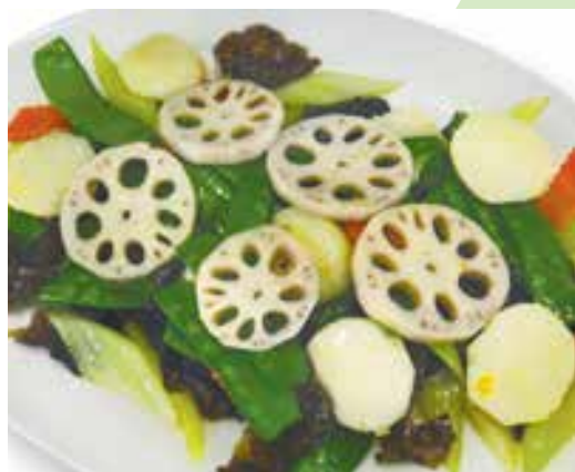
泮水芹香 (素) £14.50 Stir fried sliced lotus root with water chestnuts, mangetout, celery, carrot and black fungus (V)