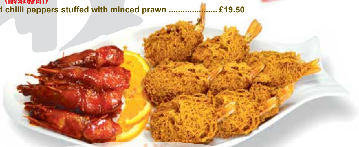
龍頭鳳尾蝦 (八只) £26.80

Shallow fried chilli peppers stuffed with minced prawn ..... £19.50