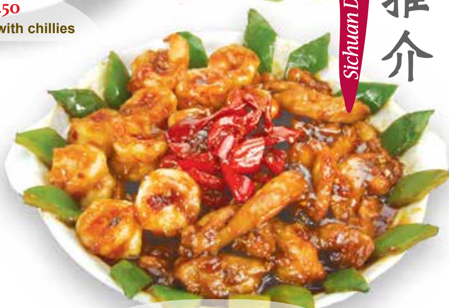
龍鳳相會 £19.00 Stir fried spiced king prawns and sliced chicken