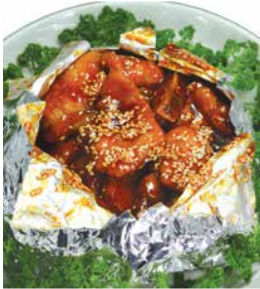
錫燒豬扒 £16.50 Pork chops with sesame seeds foil grilled