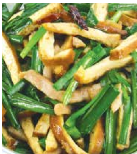
青韭肉絲豆乾 £16.00 Stir fried shredded pork with sliced dried tofu and chives