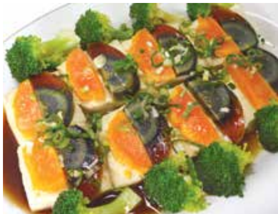
千歲豆腐 £15.50 Steamed tofu with sliced preserved duck eggs and sliced salted duck eggs