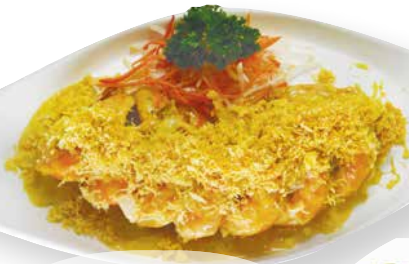
金絲奶油大蝦 (十只) £26.00 Deep fried shell-on king prawns coated in fried egg batter