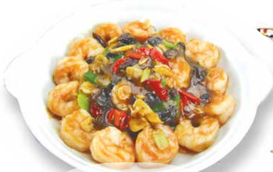
香辣蝦球 £18.50 Stir fried king prawns with chillies