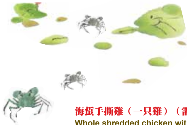
海蜇手撕雞 (一只雞) (需要預訂) £39.50 Whole shredded chicken with marinated jelly fish (pre-order only)