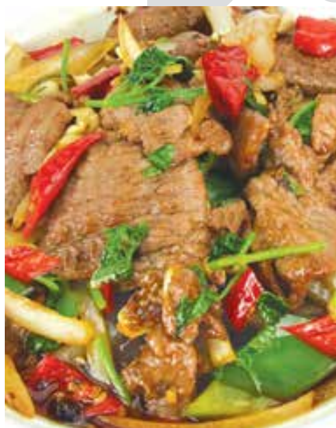
老乾媽炒羊肉 £18.00 Stir fried sliced mutton in Laoganma chilli sauce