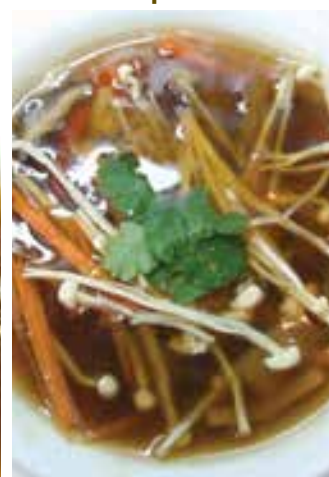
金菇四寶羹 (每位) £6.50 (per head) Four treasures mushroom, shredded duck and winter melon soup