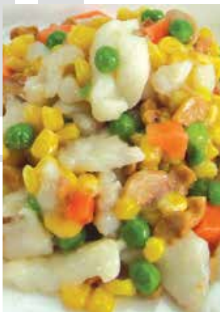
金粒魚米 £21.50 Stir fried diced fish and sweet corn