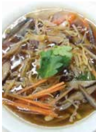
瑤柱鴨絲羹 (每位) £6.50 (per head) Sundried scallops and shredded duck soup