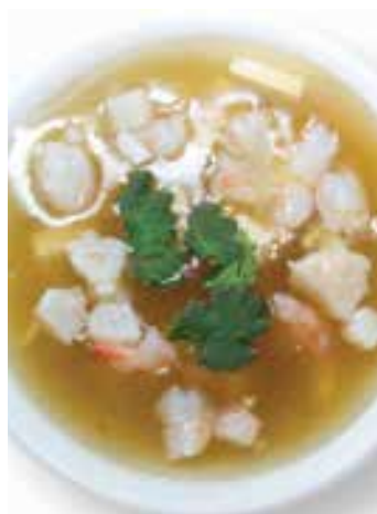
翡翠海皇羹 (每位) £7.50 (per head) Jade diced seafood soup