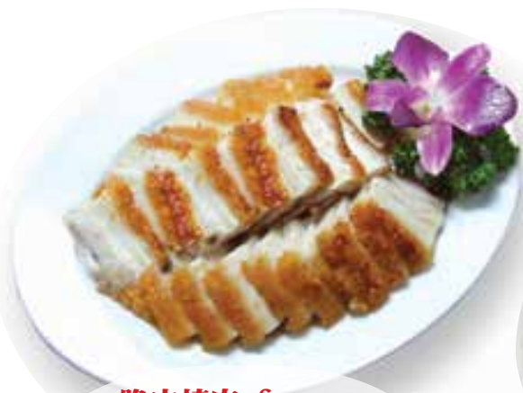
脆皮燒肉 £15.00 Roasted belly pork