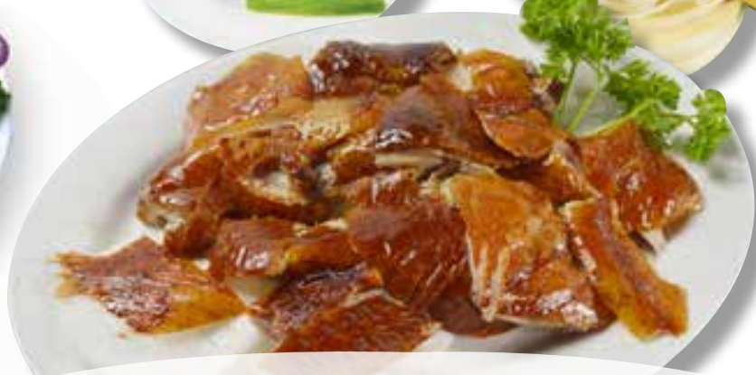
片皮鴨 每只 Whole £38.00 半只 Half £24.00 Sliced glazed roast duck served with spring onion, hoi-sin sauce & pancakes (另外椒鹽鴨架 每只 Whole £12.00 半只 Half £8.00)