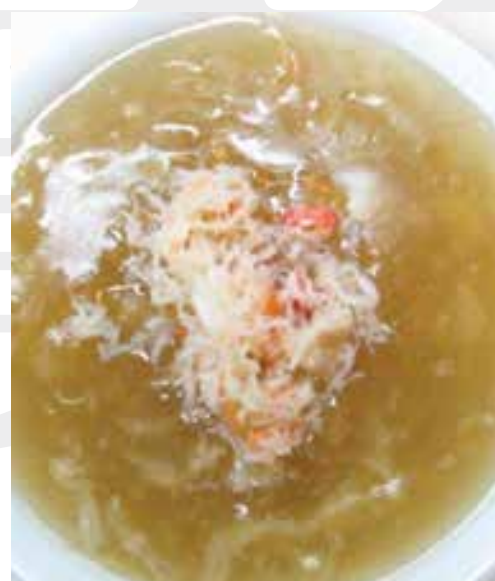
紅燒蟹肉翅 (每位) £18.00 (per head) White crab meat shark's fin soup