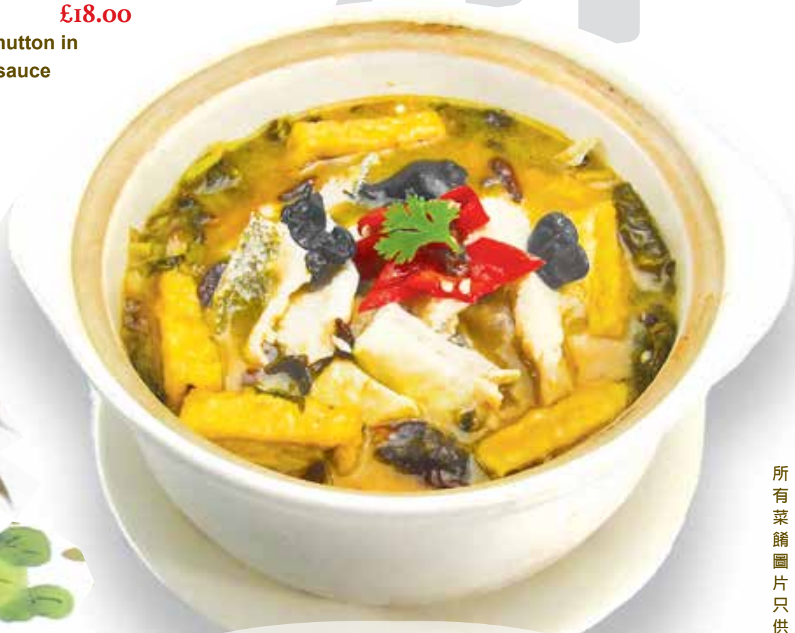
沙煲酸菜鱸魚 £32.80 Sea bass with preserved pickled vegetables casserole