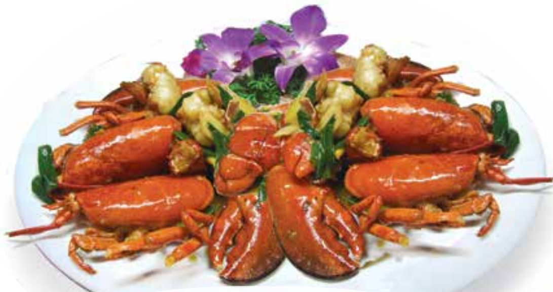
薑蔥焗龍蝦 Seasonal price 時價 Baked lobster with spring onion & ginger