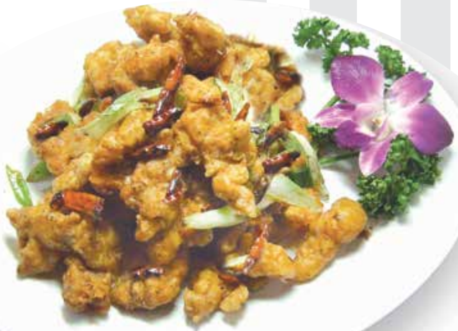
四川辣子雞 £16.80 Sichuan style spicy hot diced spring chicken

Beijing style dumplings (Pak choi and minced pork dumplings or minced pork and chives dumplings) (10 pieces).....£11.00