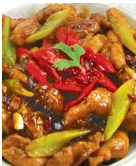
貴州香辣雞 £16.00 Guizhou style dry fried sliced chicken with chillies