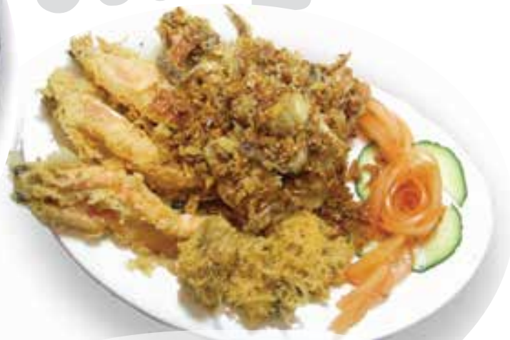
避風塘三寶 (軟殼蟹、大蝦及生蠔) £24.80

Steamed crab with garlic and glutinous rice in bamboo steamer