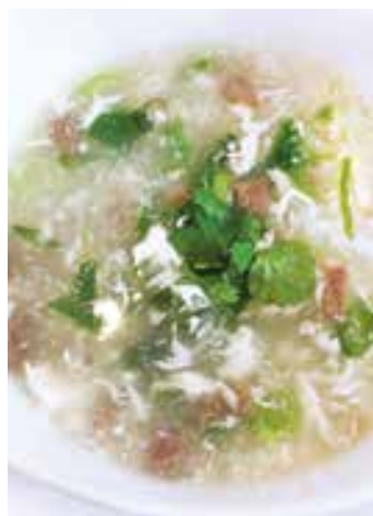
西湖牛肉羹 (每位) £6.50 (per head) West Lake beef thick soup