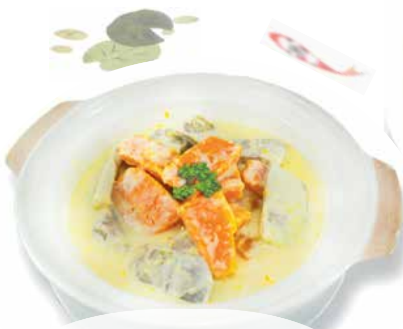
奶香南瓜香芋煲 £16.50 Braised sliced pumpkin, taro cook with milk and butter clay pot