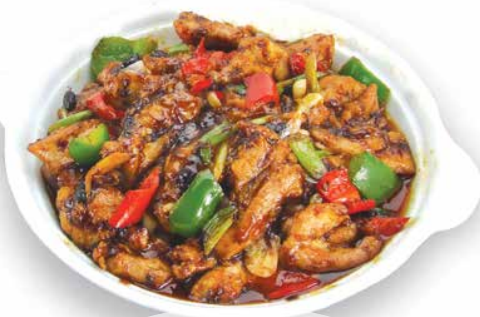
大千子雞 £16.00 Painter Daqian style stir fried sliced chicken with chillies