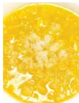
粟米魚肚羹 (每位) £7.50 (per head) Fish maw and sweet corn soup