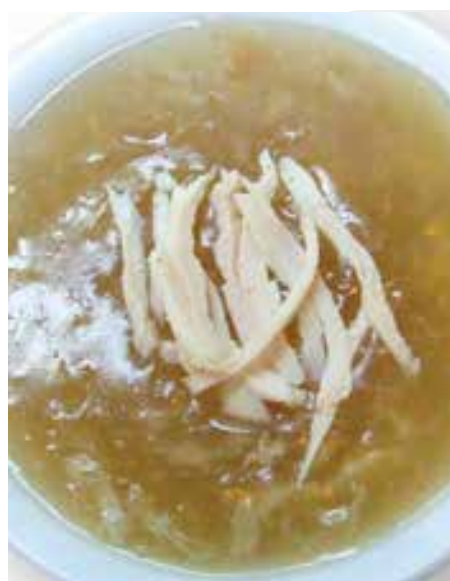
紅燒雞絲翅 (每位) £17.00 (per head) Shredded chicken shark's fin soup