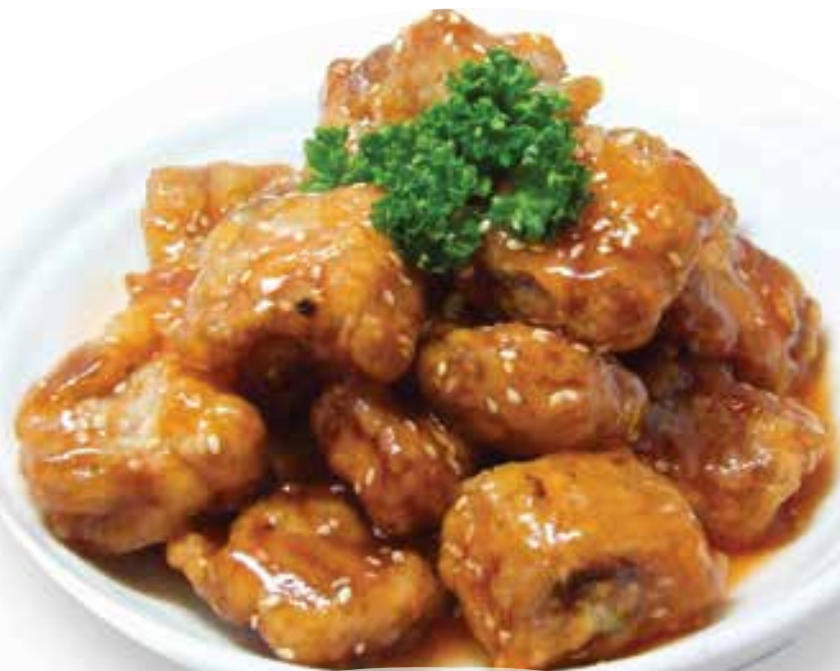
糖醋麻仁排骨 £16.80 Sweet vinegar spare ribs with sesame seeds