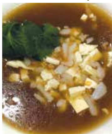
正宗海鮮酸辣湯 (每位) £7.00 (per head) Hot & sour seafood soup